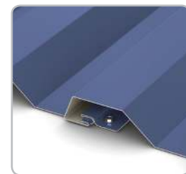
Detail of HR-16 Panel Interlock

Pictured Above Project: Anne Frank Inspire Academy Architect: RVK Architects General Contractor: Turner Construction Company Installing Contractor: Cram Roofing Company Color: Terra-Cotta